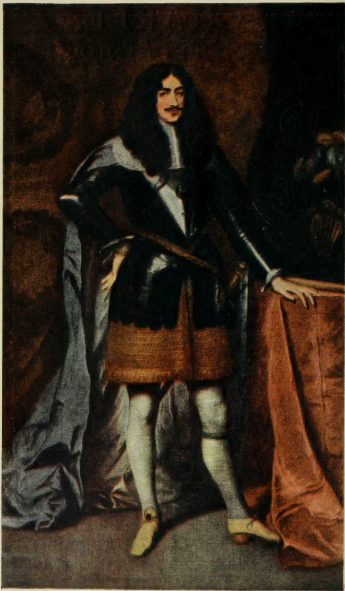
CHARLES II AT THE TIME OF HIS RESTORATION